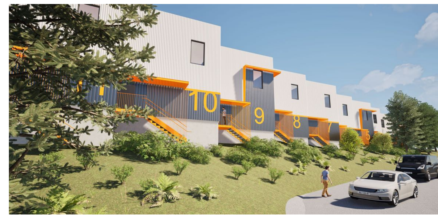
3 STREET VIEW BLDG A Scale: Actual Size