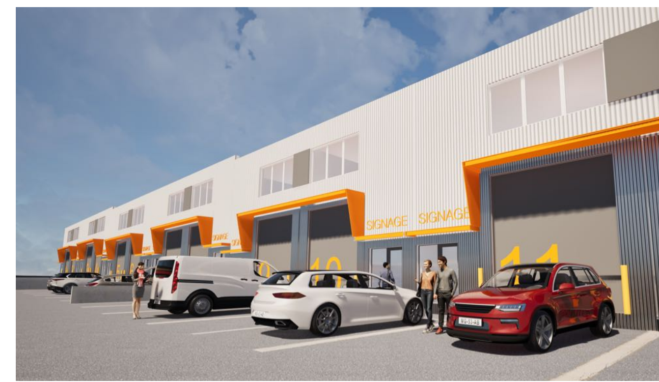
2 PARKING VIEW BLDG A Scale: Actual Size